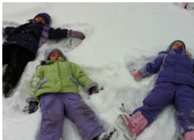
Preschoolers making snow angels on the playground.